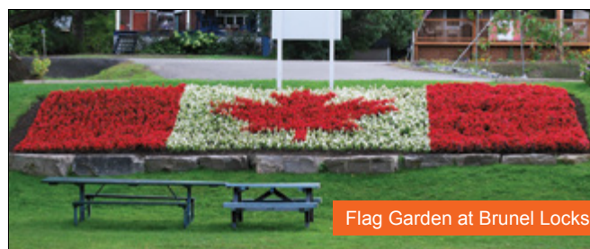
Flag Garden at Brunel Locks

Season Passes are available from the Canada Summit Centre and at Brunel Locks.